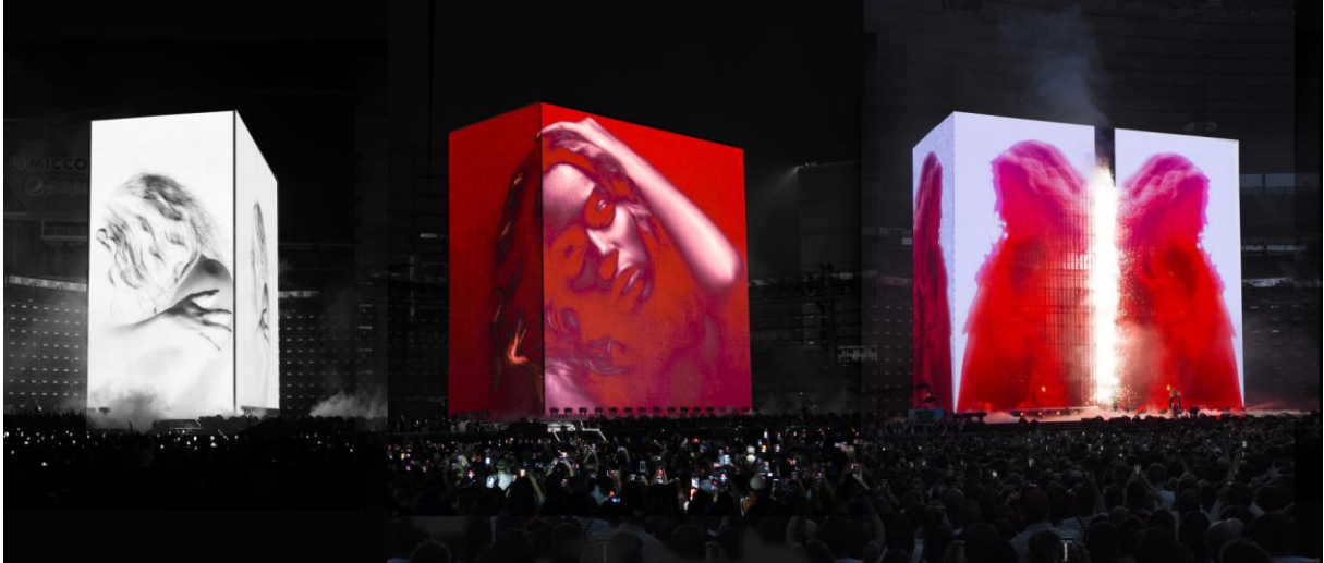
Es Devlin: Beyoncé Formation Tour 2016