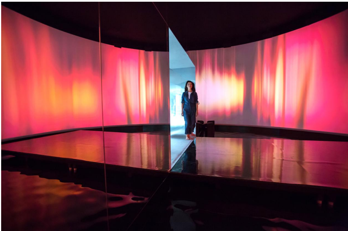
Es Devlin: Mirrormaze 2016

The first Eyes & Ears Inspiration Award winner 2020 is: British artist and set designer Es Devlin.